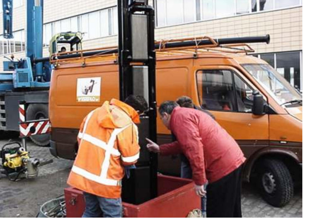
Inspection of a GeoThermic system by Westerlo, in the Netherlands. SWEP B45 BPHEs being lowered into the drilled well.

In a cold storage system, heat in groundwater is used during winter for climate control, i.e. heating. The somewhat cooler groundwater is then returned underground. In summer, the stored cool water can be pumped up again, this time for cooling. The warmed water is returned underground, completing the cycle.